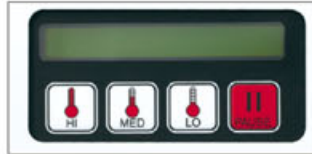
Vending control (AUT-VE)