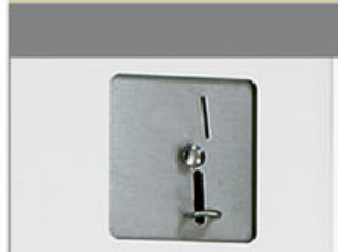
Coin-op control (AUT-ME) Microprocessor exclusive to the STI-14 coin-op dryer.