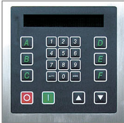
Standard Control (S): During the cycle, the display informs the user of the current temperature, the remaining time and the progress of the cooling cycle.